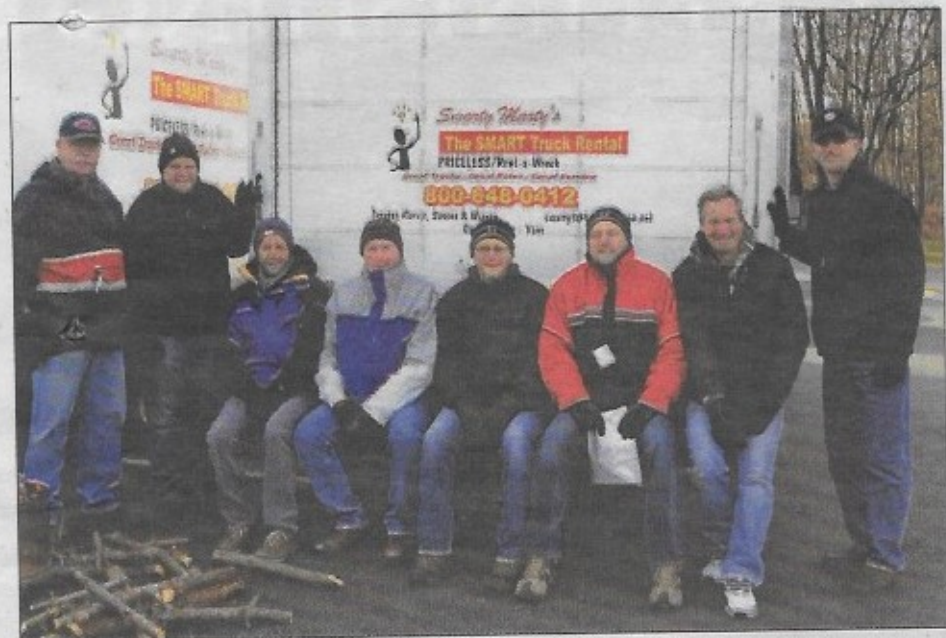
Some of the "Few Good Men" gather in front of the refrigerator truck that is used to deliver the frozen turkeys.